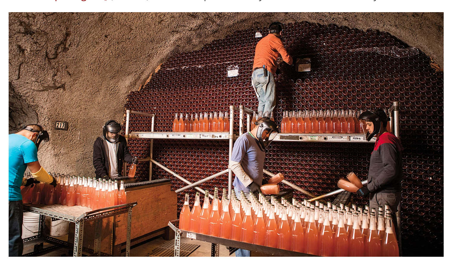
Schramsberg cellars in Napa Valley age many of their sparkling wines using méthode traditionnelle.

detail/id/1312037/name/schramsberg-brut-north-coast-mirabelle-33rd-bottling--1] (91, $31) is plush yet vibrant, with a lilting mix of baked apple and strawberry flavors. Paula Kornell's Brut California NV [https://www.winespectator.com/wine/wine-detail/id/1305321/name/paula-kornell-brut-california--1] (90, $22) is expressive and vivacious, while Louis Pommery's Brut Rosé California NV [https://www.winespectator.com/wine/wine-detail/id/1311788/name/louis-pommery-brut-ros%C3%A9-california--1] (89, $27) is fragrant with rose petal and strawberry blossoms. Snappy and sleek, Mumm Napa's Brut California Prestige NV [https://www.winespectator.com/wine/wine-detail/id/1313674/name/mumm-napa-brut-california-prestige--1] (89, $24) features expressive Meyer lemon and strawberry notes.