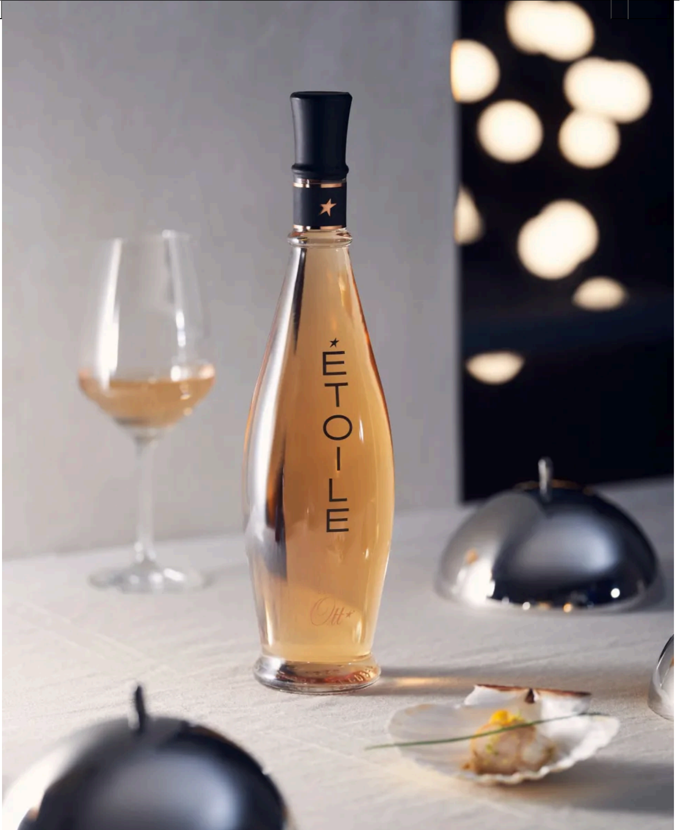
Domains Ott Éttoile Provence Rosé 2021. Domains Ott