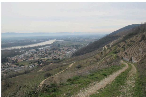
St-Joseph Le Paradis vineyard, looking downstream over the village of Mauves.